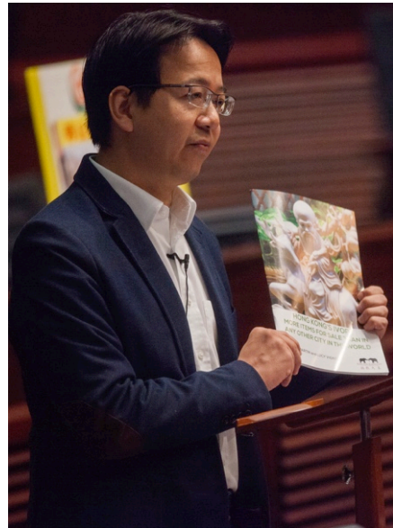
Hong Kong LegCo member Charles Mok speaks during the motion on the ivory bill brandishing the ECF-funded report on Hong Kong's ivory trade.

Creating political momentum for change in Hong Kong required a united front by conservationists and rare bipartisan support in a politically divided city. Save the Elephants and WildAid worked with WWF's well-respected Hong Kong office to host a press conference in synchrony with a parallel event in Nairobi. The news made waves in Hong Kong, and soon the report was being waved in the territory's Legislative Council assembly.