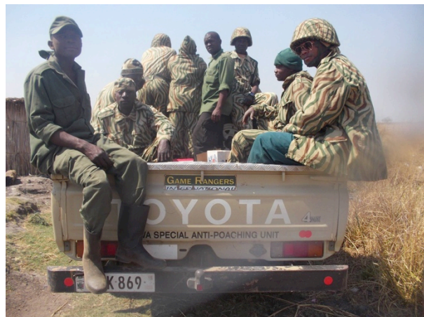
Game Rangers International scouts about to set out on patrol in Kafue, Zambia.

The elephants of the Kafue ecosystem in Zambia—one of the largest protected areas in the world—are under attack. As increasing numbers of people come across the border from the Democratic Republic of Congo, traffickers who want to exchange cheap Chinese goods for ivory enter Zambia. The threat has doubled since this time last year, with almost every patrol now intercepting armed poachers. Nowhere was worse affected than northern Zambia's Busanga Plains.