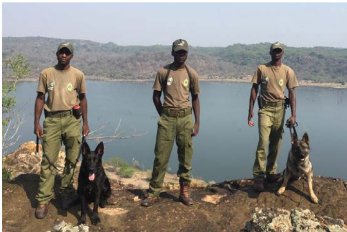
The Gonarezhou National Park Canine Unit with two German Shepherds trained in tracking and detection of firearms, ammunition and ivory.

In 2015, at least 102 new rangers were trained in anti-poaching work—some of these by US Marines and Special Forces—in Cameroon, Gabon, Nigeria, Mali, and Kenya. Collaborations between park rangers and government troops were fostered, bringing national defense forces into play in the Democratic Republic of Congo (DRC) and Mali. Informer networks were developed in many areas to guide operations. Collectively, the projects have made 572 arrests and recovered at least 91 firearms. High-tech elephant tracking systems to support anti-poaching efforts were installed in