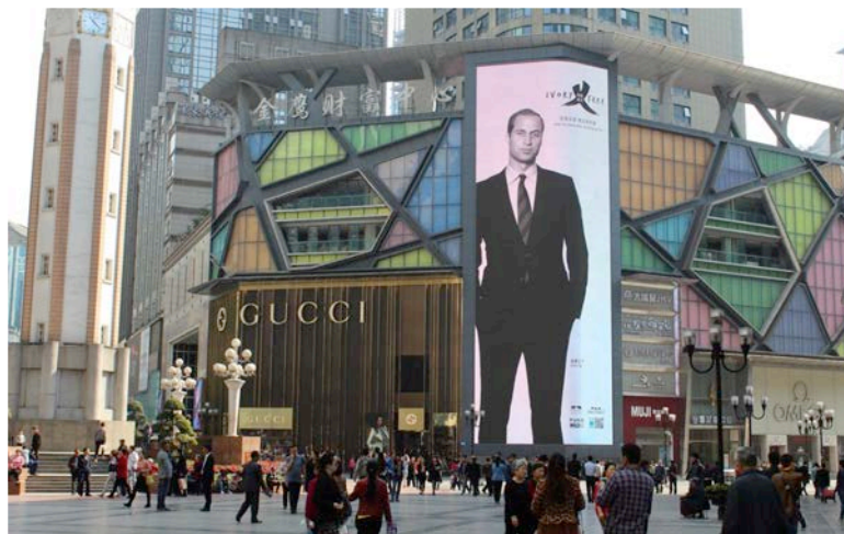
An Ivory Free ad—partially sponsored by the ECF—featuring HRH Duke of Cambridge in the central square of Chongqing (urban pop. 7.5 million).

This trend gives hope that, if all parties unite, the trade could be brought down to background levels. While encouraged by these positive developments, all of our partners agree that these gains will likely be reversed if the ban is not implemented promptly and effectively. The pressure must be maintained.